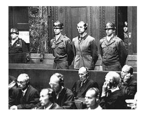
Brandt on trial, August 20, 1947

Even before the official closing of the T-4 program, gas euthanasia technology, developed by its medical scientists and engineers, was transferred to the East. The Wannsee Conference of January 1942, codifying the plan to exterminate all Jews under German control, confirmed a reality. Through 1941, the Germans and their allies had been shooting, starving and doing whatever they could to kill Jews. However, the sheer numbers of exterminating an additional 4,500,000+ was not technically possible. The strain on the German war machine, resources and men was increasing destructive to Germany's effort to win the war. They needed a better way. Brandt provided the technology. The German engineers upgraded Brandt's T-4 technology to industrial levels.