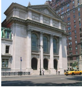
Shearith Israel - 1860

At the dedication of Shearith Israel's new house of worship in New York, April 17, 1818, Noah was asked to be one of the speakers. Noah expressed the ancient longing of the Jewish people for Zion and the pragmatic realism that characterized his life.