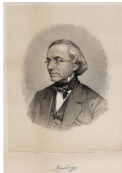
Rabbi Isaac Leeser

"... God is at this moment working upon their minds to favor the Jews, while in many parts of the world He is inclining the Jews to entertain more tolerant views towards the Christians. We in this generation may be impelled to commence the good work, which succeeding generations will accomplish."