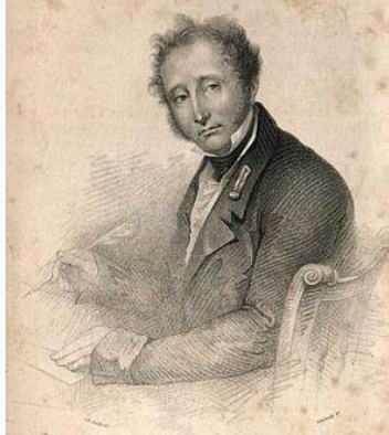
Mordecai Manuel Noah

“And on the seventeenth day of the seventh month the ark came to rest on the mountains of Ararat”