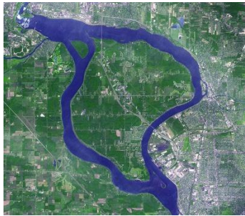
Grand Island, New York

17,381 acres about eight miles long six miles wide. Known locally as Grand Island 15 its ownership had only recently been conceded to New York by the Canadians and the extinguishment of Iroquois land claims. Noah recognized the economic possibility of Grand Island and its strategic location in the Niagara River highway of commerce. He also recognized the possibility of populating the Island as a refuge city for the oppressed Jews. On the one hand it was a bold and innovative idea to solve the Jewish problem. On the other hand, if Noah could manage to gain control of the area, it could be very good for the country, for the Jews and for himself financially.