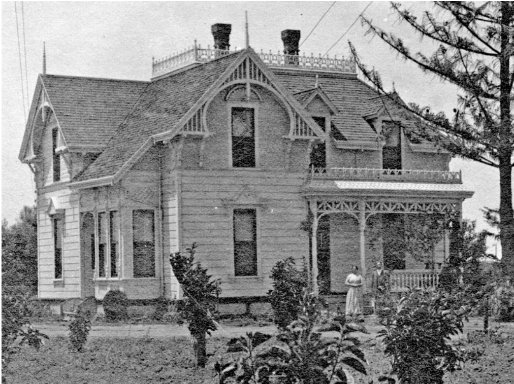
Barber-Eitzen house at 138 Third Ave., 1892

1910 - Wilma Meredith article on "Chula Vista. . . Yesterday and Today" -- "In reviewing my articles on CV, I am able to give a graphic picture of the townsite as it was over sixty years ago. Picture a rolling landscape of sage brush and cactus dotted here and there with a sparse sprinkling of eucalyptus, palm and pepper trees, and open country where cattle grazed. The first house of any size was started on what was later called Third Ave. The house is now known as the Eitzen place." [Abraham Eitzen came to CV in 1910 and built one of the original orchard houses in the block west of Fredericka Manor] (Chula Vista Star, Apr. 23, 1948.)