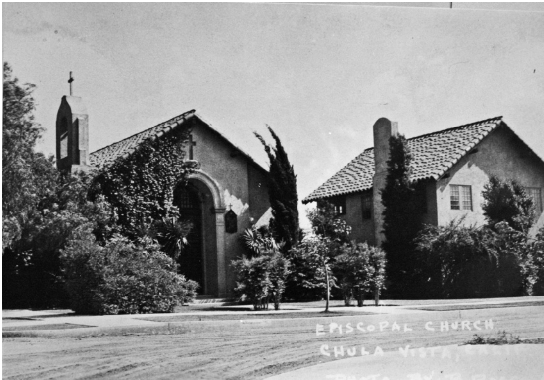
St. John's Episcopal Church built 1924 (CENT_0330 from Chula Vista Library)