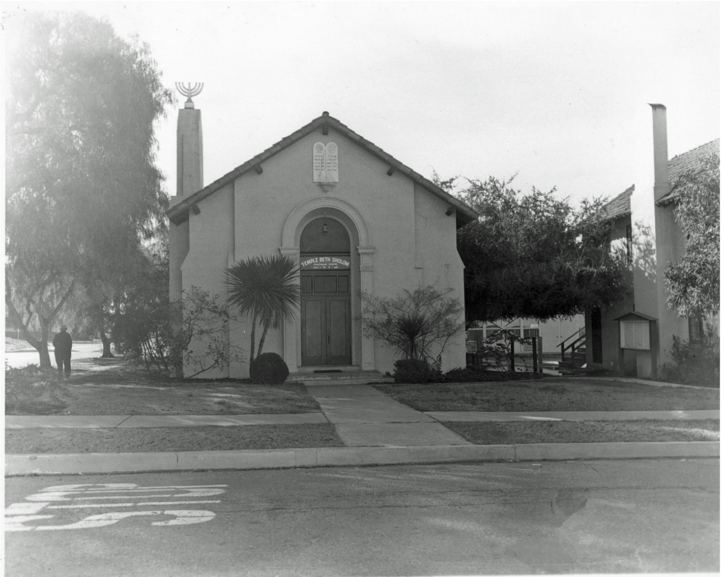
1958 Temple Beth Sholom