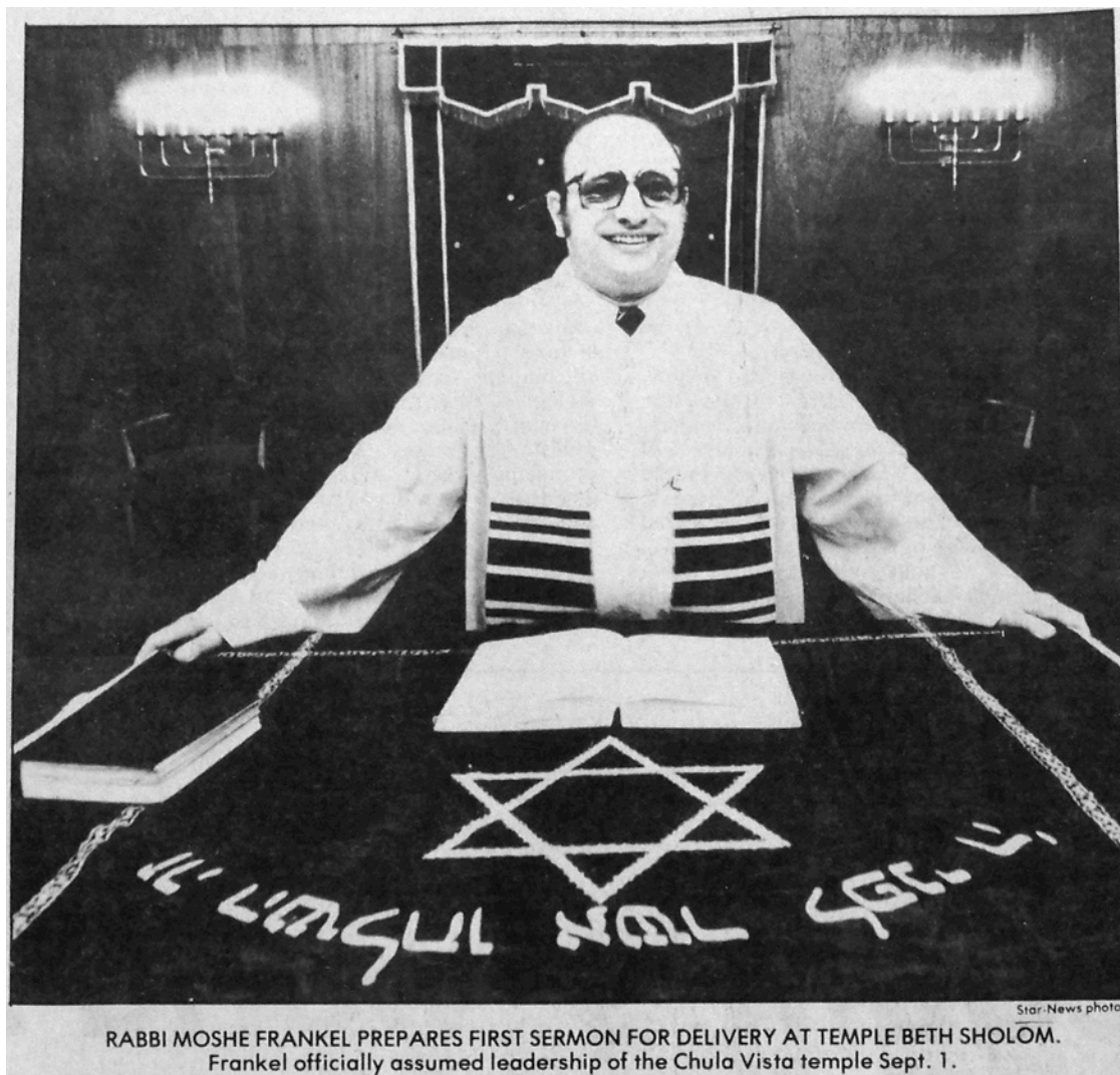
Chula Vista Star-News Sept. 6, 1979