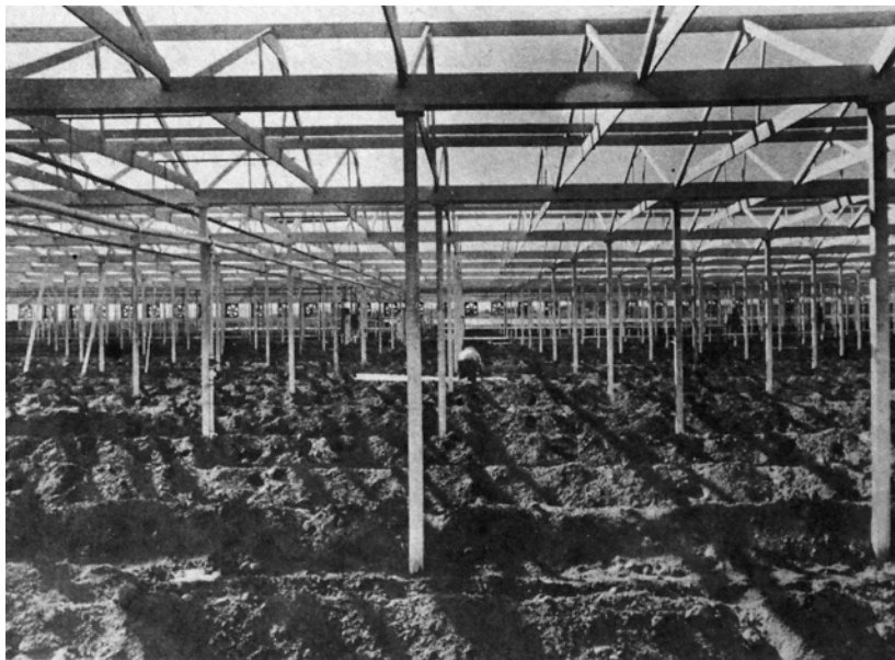
Chula Vista Star, Nov. 29, 1973

1973/08/16 - Sam Vener was exempted from the bayfront moratorium and allowed to build temporary greenhouses ( Chula Vista Star-News, 1973. )