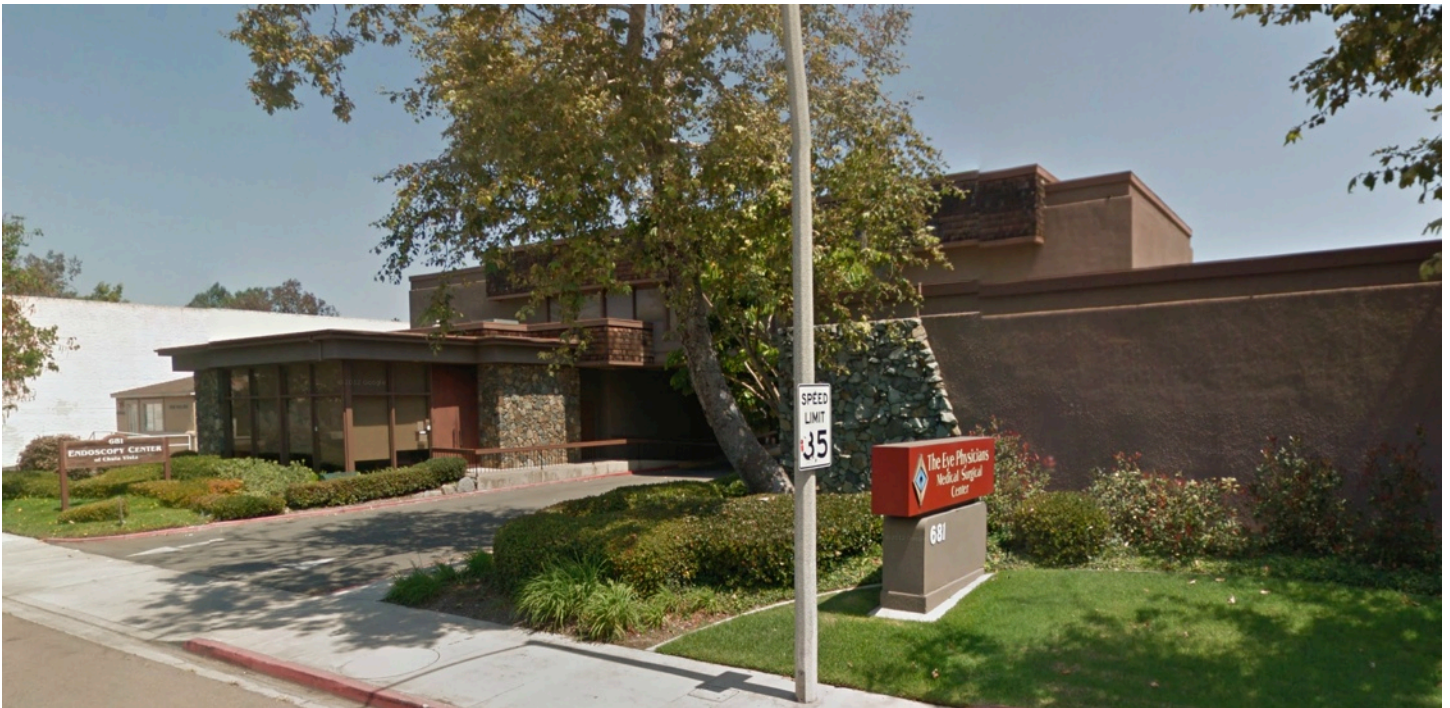
Eye Physicians Medical Surgical Center at 681 Third Ave

eight years later the office moved into its present quarters at 681 Third Ave., where it became the Eye Physicians Medical Group of Chula Vista. ( San Diego Union-Tribune, Nov 9, 1995. )