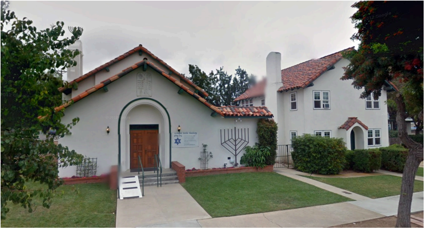
Temple Beth Shalom in Chula Vista